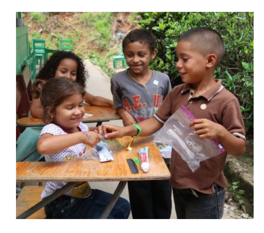
Children were given toothbrushes and instruction in brushing