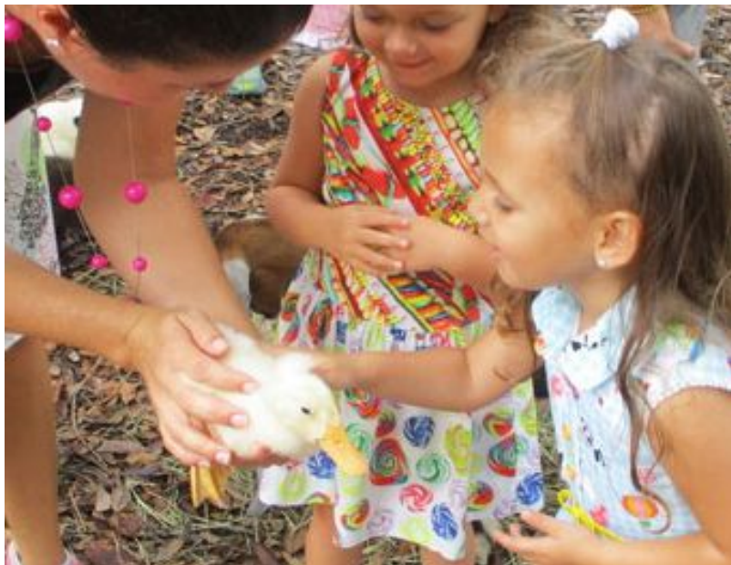
Making New Friends of Ducklings