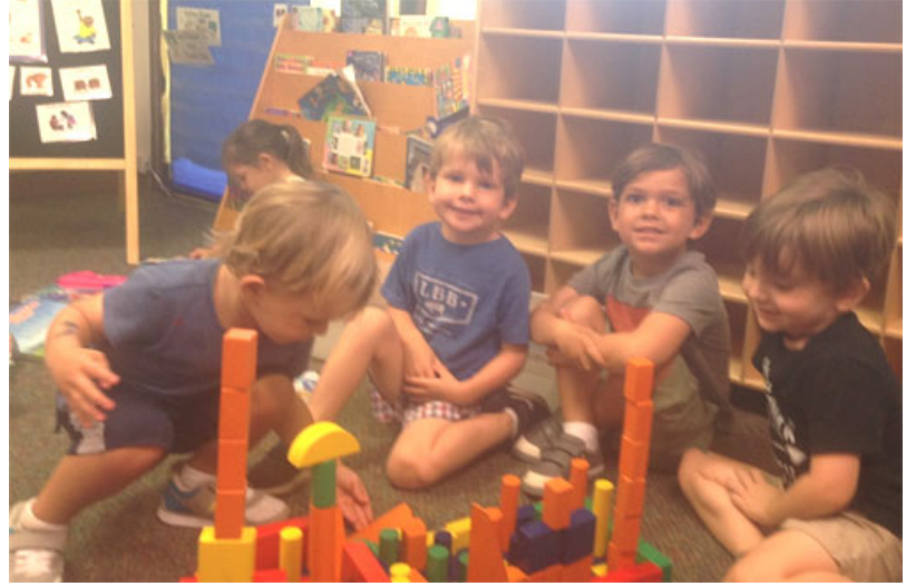
Construction Camp - What Fun!