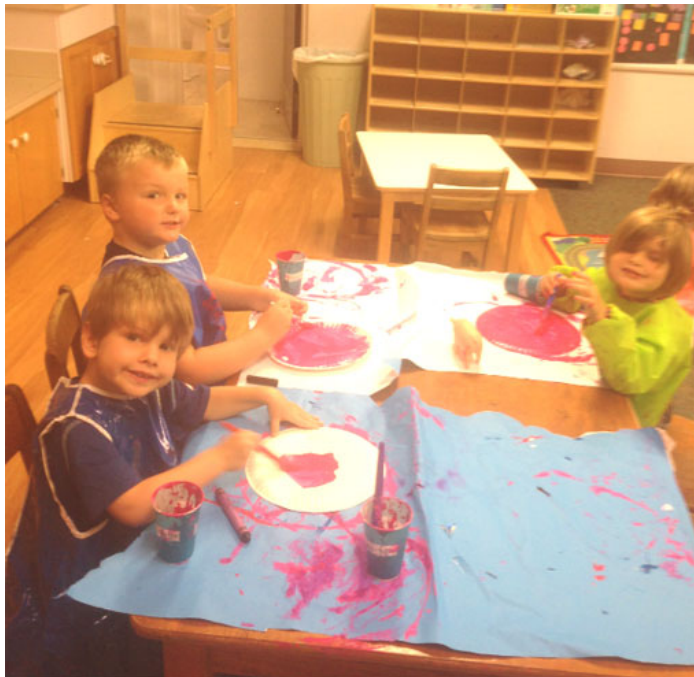
Creative Young Artists At Work