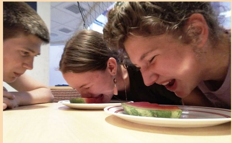
A Watermelon Challenge!