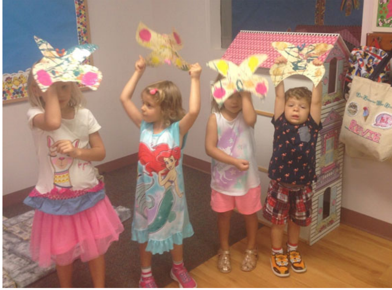
Students Created Beautiful Butterflies