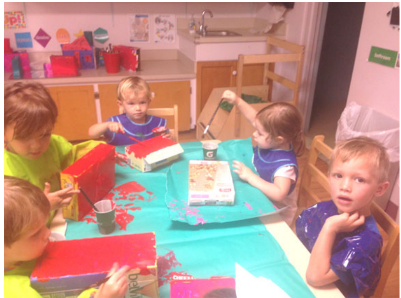
Working On An Important Project!