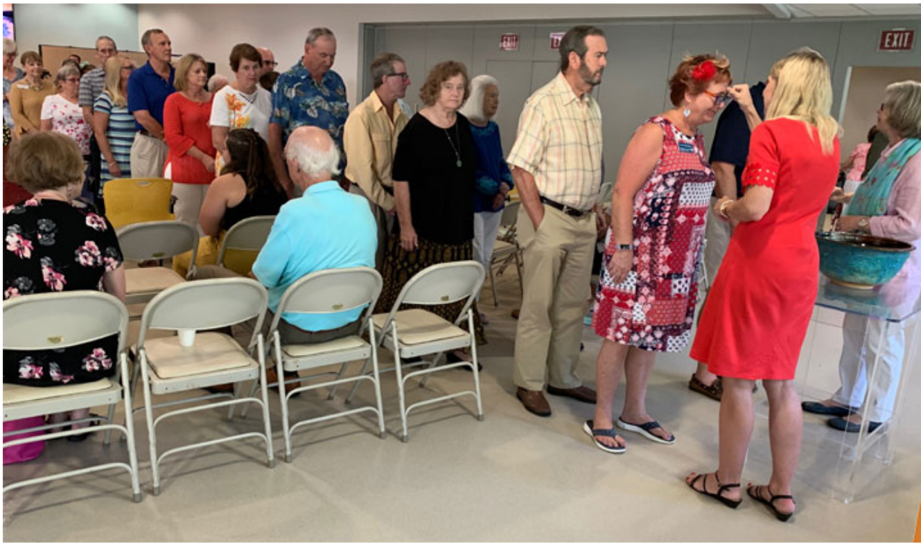
We reaffirmed the covenant of baptism.