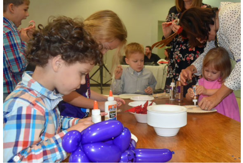
Seasonal Hats.....Balloon Animals