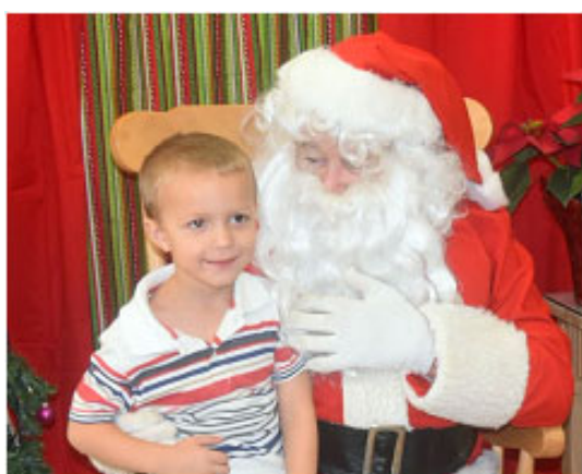
Visit From The Jolly Old Elf