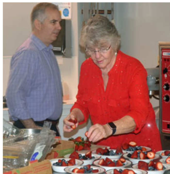
Thank You To Our Scrumptious Culinary Experts For Preparing Delicious Food