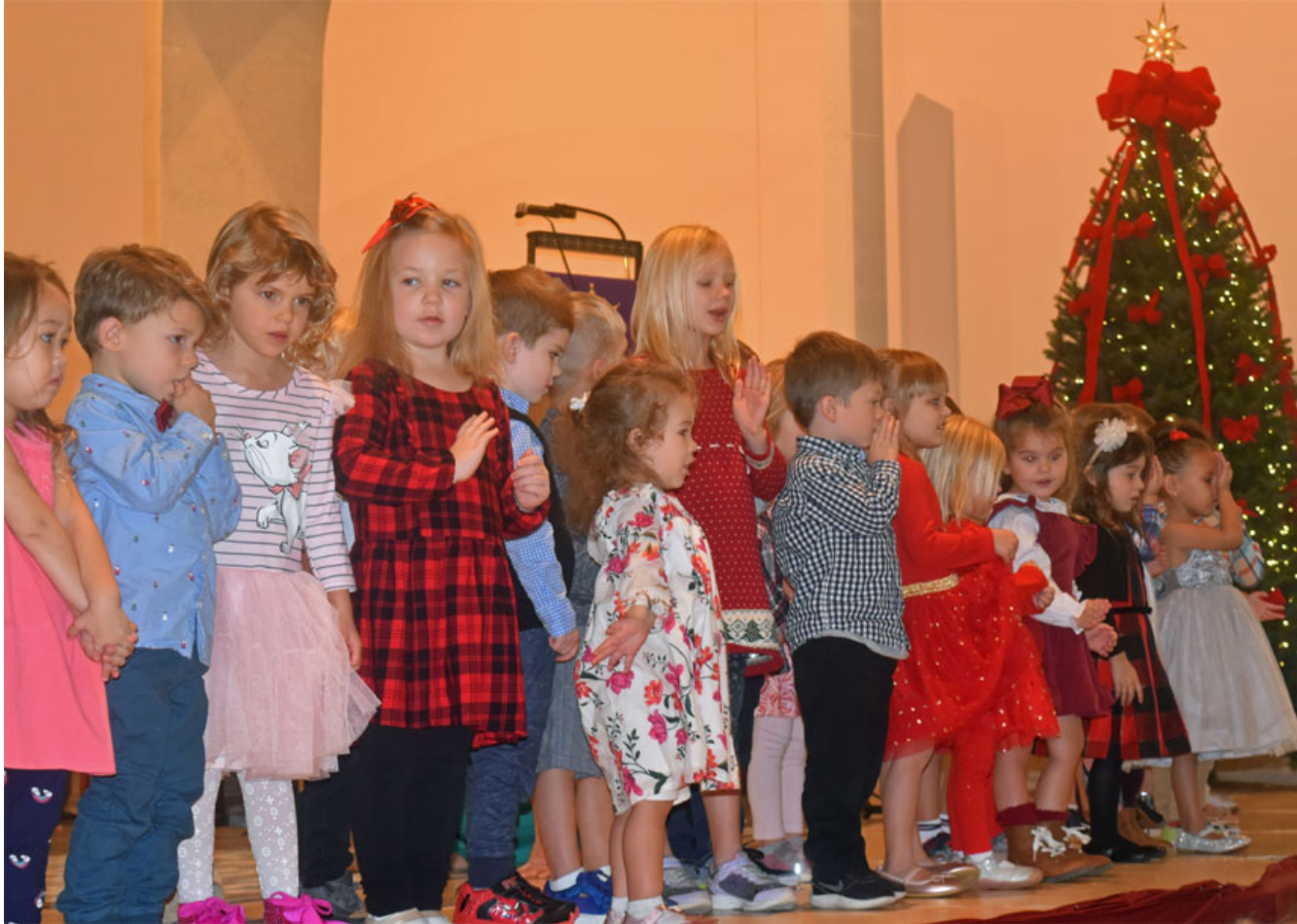
Day School students shared Christmas carols