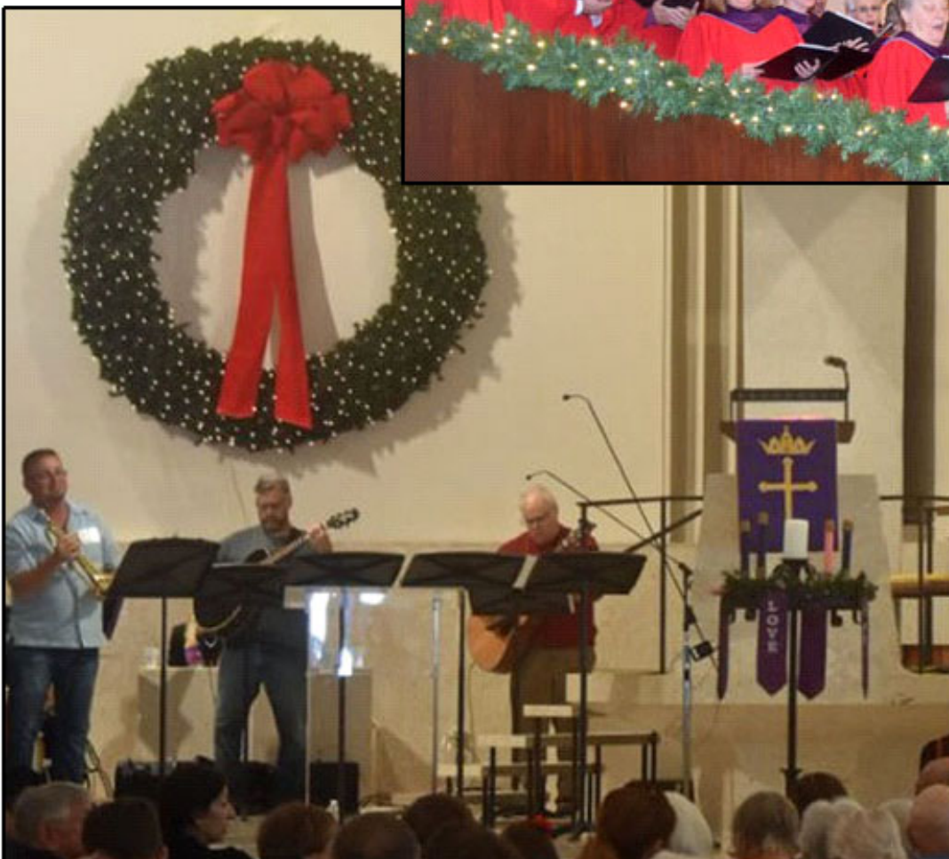
Praise Band and Chancel Choir