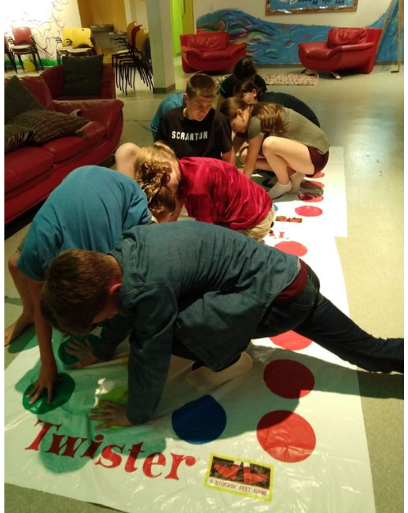
Games, Delicious Food, Fun With Friends