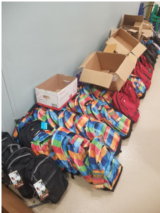
Just a few backpacks...