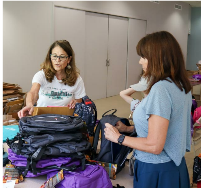
Assembly line to stuff backpacks