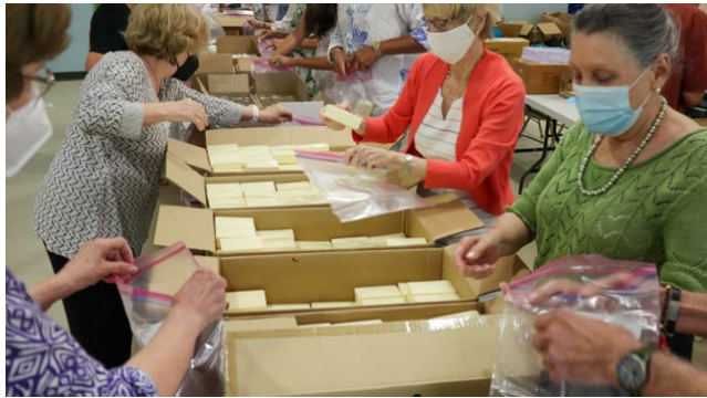
Assembly line for packing hygiene kits